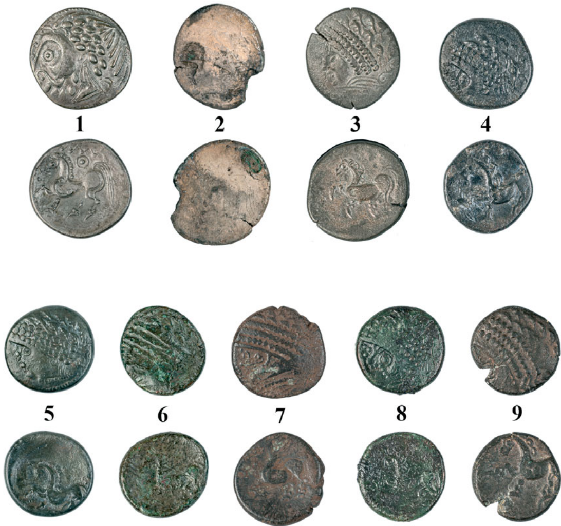
Fig. 1 — Late Iron Age coins from Kuzelin (see: Tab. 1) Sl. 1 — Mlađeželjeznodobne kovanice s Kuzelina (vidjeti: tab. 1)

As already noted, the coin record of the Kuzelin hillfort consist almost exclusively of Tauriscan coins, with only a single exception. It is a tetradrachm of the Zickzackgruppe (Sztálinváros/Dunaújváros) (MPS inv. 166/94; Bilić 2017: 228, 236, 240, Tab. 1: cat. no. 17). This type of coin was issued in the period from the late 3 rd to the 1 st half of the 2 nd century BC in Transdanubia and thus represents an import to south-western Pannonia (Pink 1939: 100; Allen 1987: 29, 80, Map 3; Dembski 1998: 46, 112; Torbágy 2000: 30; Ziegauš 2010: 215). Moreover, its Lt C2-date apparently suggests a different temporal horizon in comparison to the rest of the Kuzelin assemblage, both archaeological in general and numismatic in particular. In one way or another, it testifies to the connections – either direct or by way of intermediaries – of the inhabitants of the hillfort with a region dis-