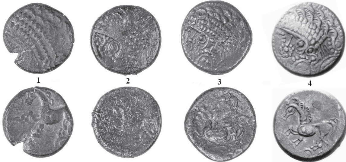
Fig. 5 — Coins of the Kuzelin B type: 1–2 Kuzelin (1 MPS 4186, photo by: I. Krajcar; 2 MPS 7377, photo by: I. Krajcar); 3 AMZ A14013 (photo by: I. Krajcar); 4 H. D. Rauch, Auction 76, Lot 47, October 17, 2005 (made by: T. Bilić)

istovremeno i izrađene, negdje u regiji. To se osobito odnosi na primjerak iz AMZ-a. Te četiri kovanice mogu se klasificirati kao tip kasnih đurđevačkih kovova za koji predlažem naziv „Kuzelin B“, na osnovu činjenice što su dva od ukupno četiri primjerka ovog tipa sigurno pronađena unutar kuzelinskog naselja. 24