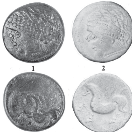
Fig. 6 — Coins from Kuzelin (1 MPS 7374) and Osječenica (2) Sl. 6 — Kovanice s Kuzelina (1 MPS 7374) i Osječenici (2)

i avers i revers ove kovanice pokazuju sličnost sa samoborskim Prijelaznim tipom, ali ipak ona ne dijeli pečate s kovanicama ovog tipa iz ostave Samobor–Okić. Kovanicu s Osječenice – zajedno s još jednom, pobliže nedefiniranom, taurišćanskom tetradrahmom (Bilić 2017: 243, tab. 1: br. 53) 26 – pronašao je lokalni zaljubljenik u arheologiju (Ožanić 1998: 36). Čini se da su te dvije kovanice jedini opipljivi dokaz za pretpostavljeno postojanje mlađeželjeznodobnog naselja na gradini jer drugi materijal iz tog razdoblja nije dokumentiran u studijama koje raspravljaju o lokalitetu, nasuprot nalazima iz kasnog brončanog i ranog željeznog doba te rimskog razdoblja (Durman 1992: 126–127; Ožanić 1998: 27–29). Iako je to možda donekle nesigurno, ipak se ne čini previše odvažnim pretpostaviti postojanje mlađeželjeznodobnog naselja na lokalitetu koji je