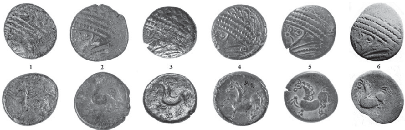
Fig. 3 — Coins of the Kuzelin A type: 1–2 Kuzelin (1 MPS 4184, photo by: I. Krajcar; 2 MPS 8338, photo by: I. Krajcar; with permission of the MPS); 3 Zagreb Upper Town (MGZ 499 A, photo by: M. Gregl; with permission of the MGZ); 4 AMZ A919 (photo by: I. Krajcar); 5 Obljaj (private collection, photo by: V. Kramberger; Cesarik, Kramberger 2018: 139, no. 44); 6 Gradina at Bruvno (private collection, photo by: M. Ilkić, reproduced with permission)

kao „izvorni“ tauriščanski novac (potvrđen u velikim ostavama, a sadržavao je veći udio srebra). Kako je metalurška analiza izvršena na samo jednoj kovanici ovog tipa (AMZ A919: Cu 72 %, Ag 5,5 %, Sn 5,5 %), bilo bi brzopleto izvlačiti generalizirane zaključke iz očito nedostatnih podataka, ali provizorno se može tvrditi da su sve poznate kovanice ovog tipa bile načinjene od slitine bakra s manjim udjelom srebra. Bez obzira na to, ova pojava mora se razumjeti kao neprekinuti nastavak ranije tradicije proizvodnje kovanica u regiji, potvrđene u razdobljima Lt C2 i/ili Lt C2/D1.