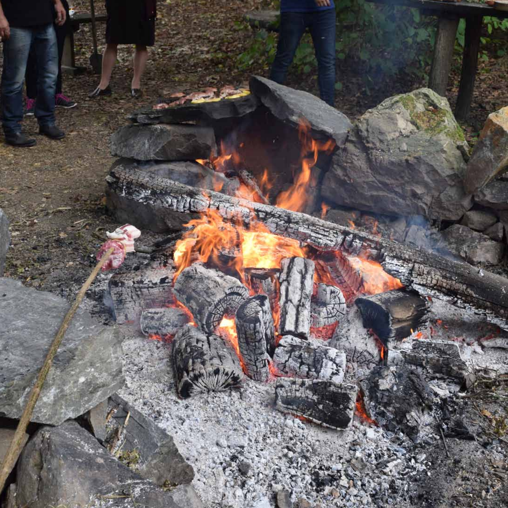
Meat baked over an open fire